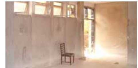
One of the freshly plastered new theatres