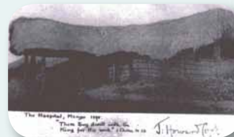
Mengo Hospital in 1898