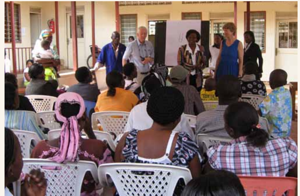
Mothers and fathers being shown how HIV/AIDS is passed on.