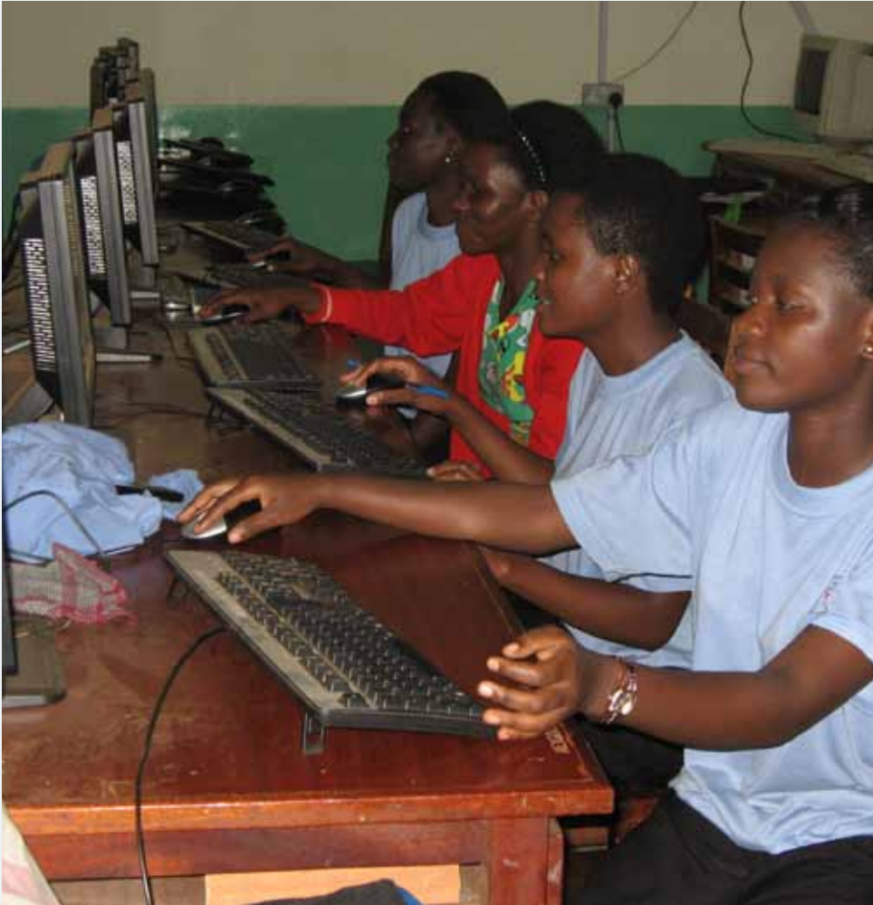
Nursing students at their computers