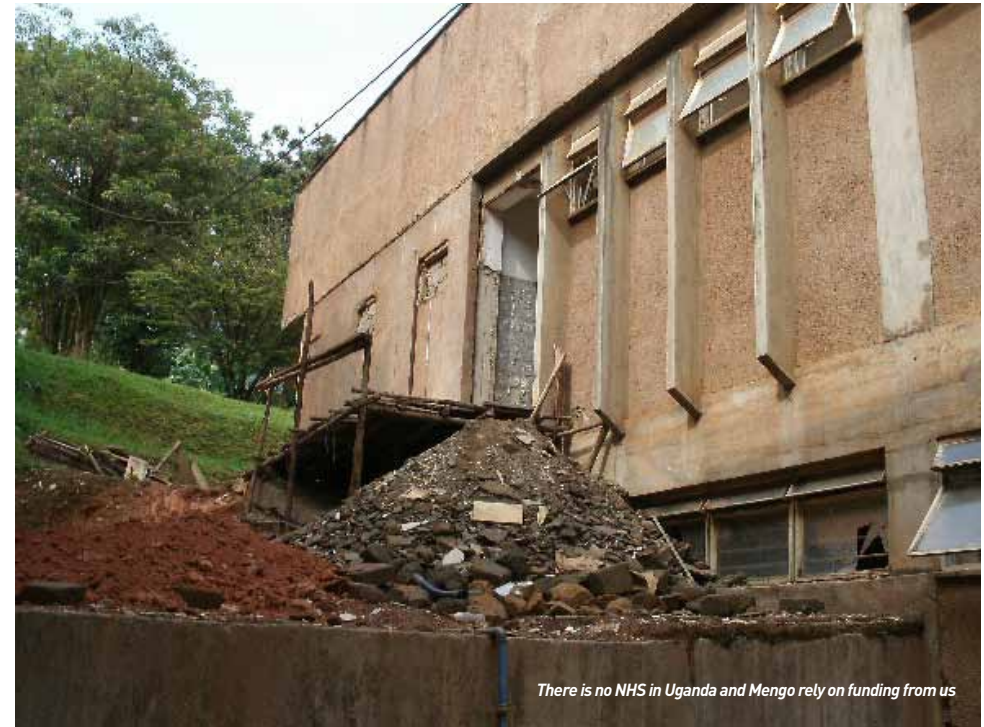
There is no NHS in Uganda and Mengo rely on funding from us

The refurbishment of the operating theatre building has progressed significantly from when the photo above was taken in January to the stage that the three theatres are nearly complete.